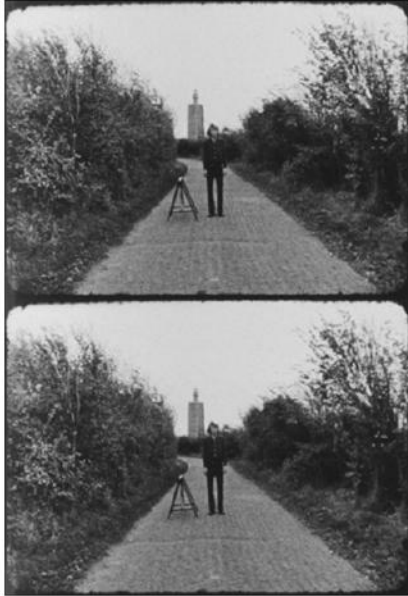
Bas Jan Ader, Broken fall (geometric), Westkapelle, Holland (1971).