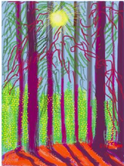
David Hockney, Untitled No. 4 (2010).

Where: Thomas Dane Gallery , 3 & 11 Duke Street, London, United Kingdom