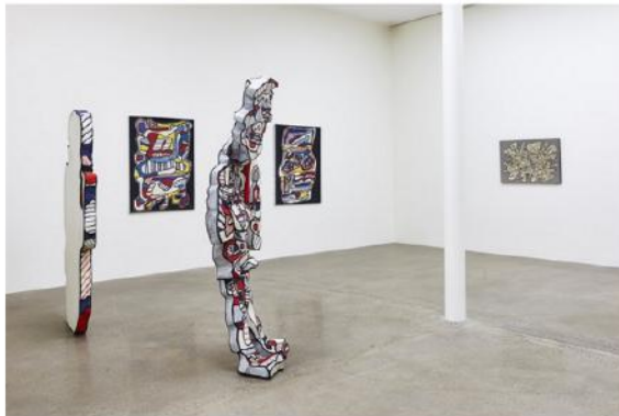
Dubuffet, Installation view, Timothy Taylor Gallery.

Where: Simon Lee Gallery, 12 Berkeley Street, London, United Kingdom