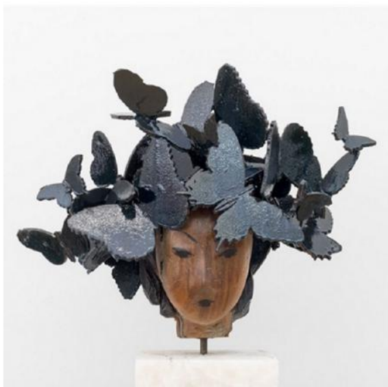
Manolo Valdés, Butterflies (2016). Courtesy of Marlborough Fine Art.

Where: Mazzoleni Gallery, 27 Albemarle Street, London, United Kingdom