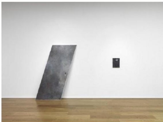
Guillermo Kuitca, Installation view , Hausor & Wirth London .

Where: Marlborough Fine Art Ltd, 6 Albemarle Street, London, United Kingdom