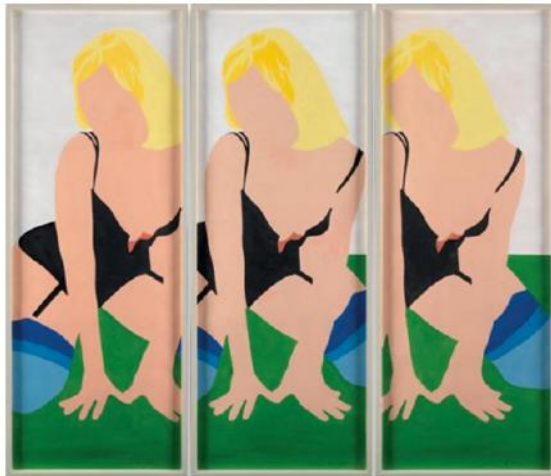
Antony Donaldson, Study for 'Three Pictures of You' (1962), Courtesy of Whitford Fine Art Gallery.