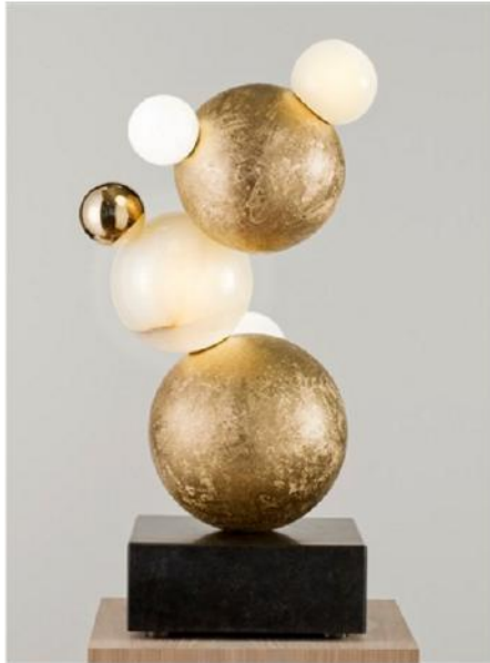
Achille Salvagni, Bubbles (2013). Courtesy of Achille Salvagni Atelier Gallery.