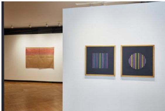
Installation view .

Where: Timothy Taylor Gallery, 15 Carlos Place, London, United Kingdom