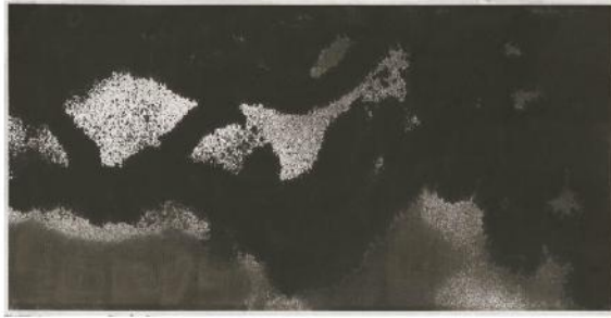
Li Huasheng, 1963 (2013).

Where: M&L Fine Art Gallery , 15 Old Bond Street, London, United Kingdom